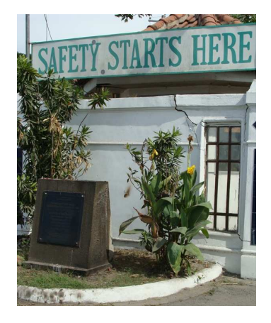
Entrance to Hacienda Luisita Community

Consequently, this ended up in the historical general strike of 2004 where the farmers united in peaceful protest about the injustices committed against them. The protest which began on 6 November 2004 saw about 5,000 farmers of the area and many other sympathisers from other parts of the country join the protest. The protesters managed to foil all attempts by the police and the military to disperse them until 16 November 2004 when the military used gun power killing 7 farmers and wounding more than 100 others. During 2005 and 2006 six more farmers were killed.