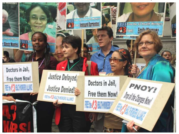
Members of Living Letters Team outside the Department of Justice

As an act of solidarity with those detained the family and friends have begun a hunger strike just as those in detention have.